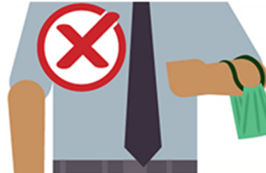
On your arm