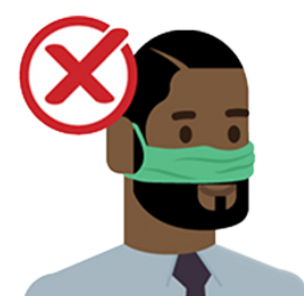
Only on your nose