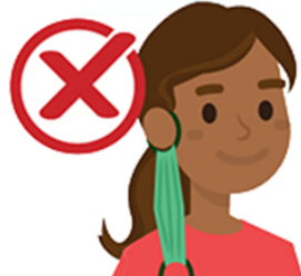
Dangling from one ear