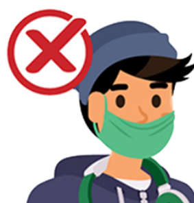
Under your nose