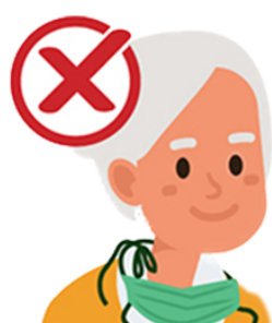
Around your neck