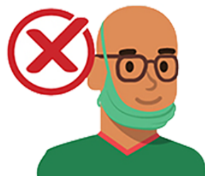
On your chin