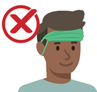
On your forehead